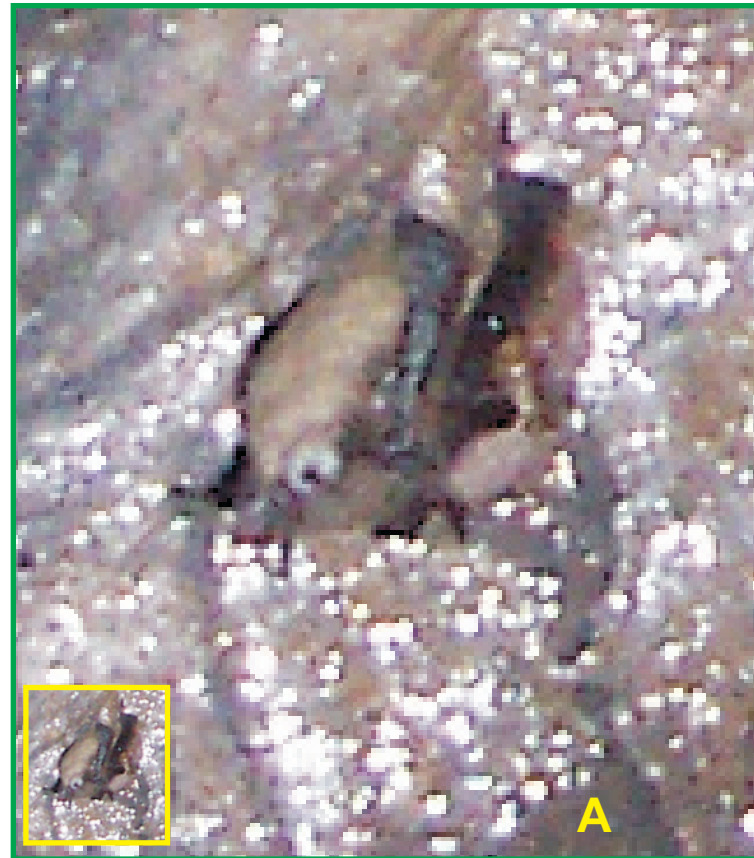
White Nosed Bat